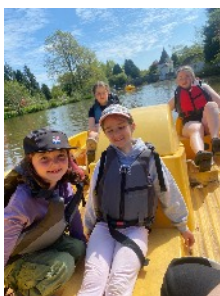
Fun at GB Camp