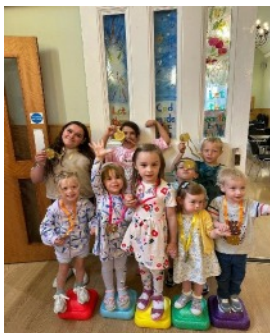
Cadder Kids Team room Olympics