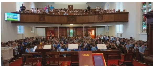
Meadowburn Primary School P7 Leavers' Service